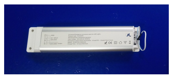
Emergency Pack EL05UPK

A compact 5W Emergency Back-Up Power Unit providing 3 Hours Maintained operation fully compliant to BS 5266-1:2011.